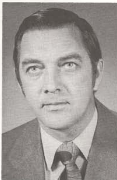
Alex B. Campbell Premier, Province of Prince Edward Island

The new Farm Centre is unique in Canada. Much more than just a centralized location for commodity board offices, it will also be a cultural and recreational focal point for every farm family and organization dedicated to the improvement of agriculture and our rural community throughout Prince Edward Island.